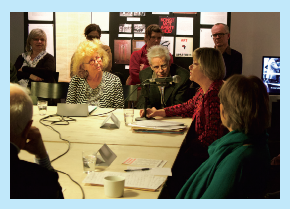
Fig.27 Tensta Konsthall, Witness Seminar: Sweden In Solidarity with Chile and Palestine

for Palestine in the context of other museums in exile, departing from The Museum of Solidarity and The International Museum of Resistance "Salvador Allende". In addition, there was a seminar called Witness Seminar: Sweden In Solidarity with Chile and Palestine, which explored the Swedish context of solidarity networks and artistic practices around the anti-Pinochet struggle and Palestinian struggle during the 1970s, together with artists and people who participated in Internationalla motståndsmuseet. The seminar focused on the history of The International Museum of Resistance "Salvador Allende" and then looked into the Swedish solidarity organization for Palestine during the same period, especially through the history of "Palestina grupperna".