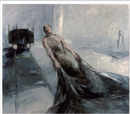
Tage Törning (f. 1925): Presenningen. Olja på duk 130 x 150 cm. Signenad: Tage Törnin Göteborgs konstmuteum.